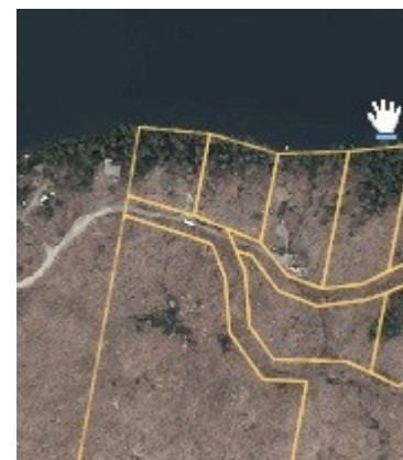
Sector B Chemin de la Baie Noire 2 properties